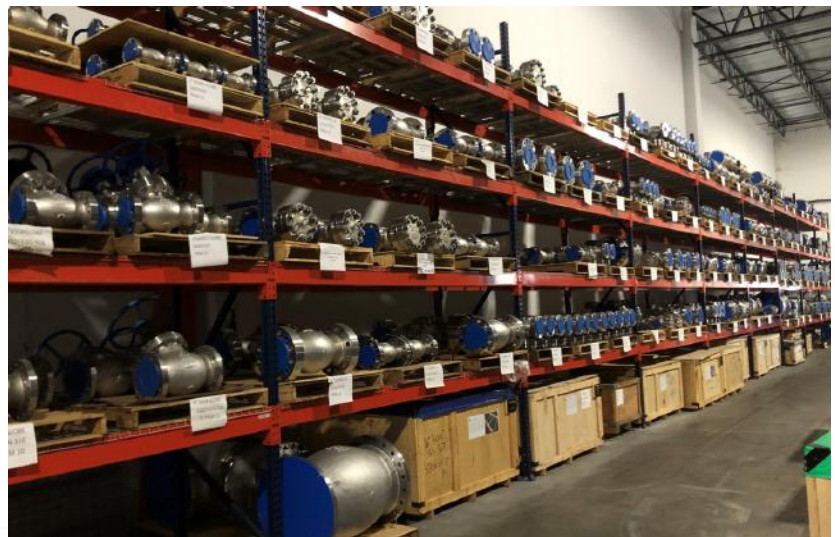
Industry leading inventory of Stainless Steel GGC in Houston