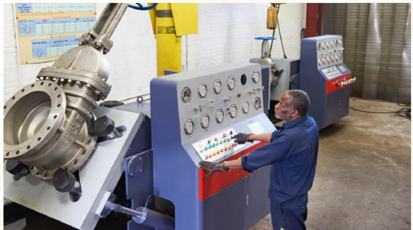
Manufacturing and testing at our Williams' New York Location