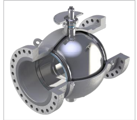
CAMERON T30 Series fully welded ball valve.

The CAMERON T30 Series valve can be equipped with a mechanism that makes both seat rings rotate at the end of the closing operation. Rotating seat rings are self-cleaning, distribute wear, ensure optimal sealing contact, and facilitate the distribution of any injected flush, grease, or sealant.