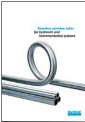
S-153 ENG Seamless stainless tubes for hydraulic and instrumentation systems