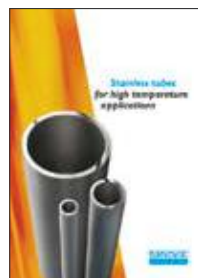
S-130 ENG Stainless tubes for high temperature applications

Look for more information in these catalogues