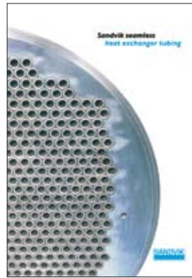
S-154 ENG Seamless heat exchanger tubing