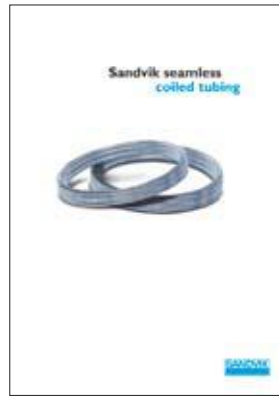
S-1281 ENG Seamless coiled tubing