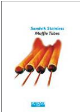
S-1301 ENG Stainless muffle tubes

Look for more information in these catalogues