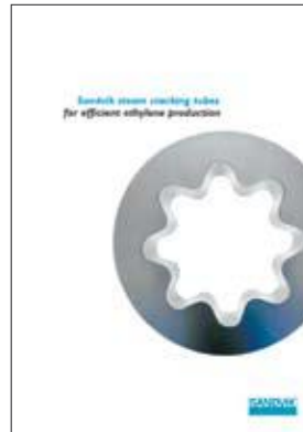
S-1305 ENG Steam cracking tubes for efficient ethylene production