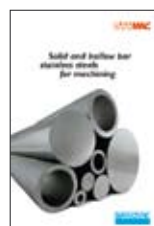
S-02909 ENG Product handbook - Sanmac solid and hollow bar