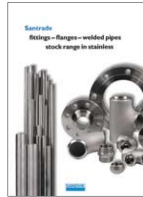
S-1131 ENG Fittings - flanges - welded pipes Stock range in stainless