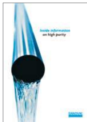
S-191 ENG Inside information on high purity