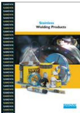
S-236 ENG Stainless welding products