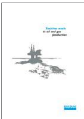
S-133 ENG Stainless steels in oil and gas production